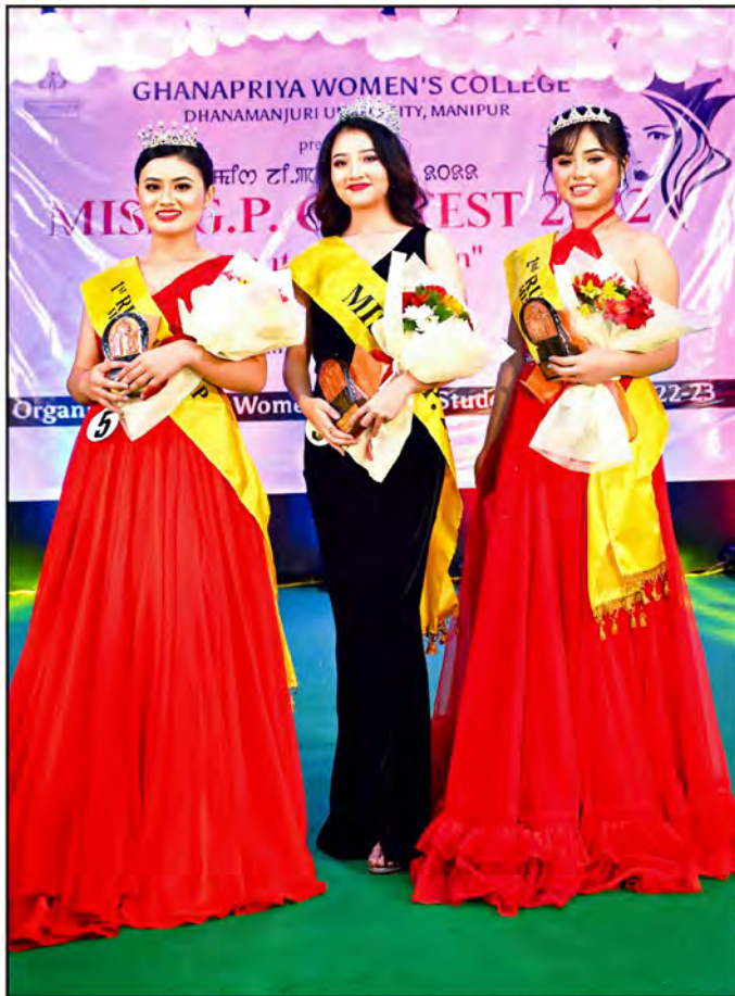
Winners of Miss GP, 2022