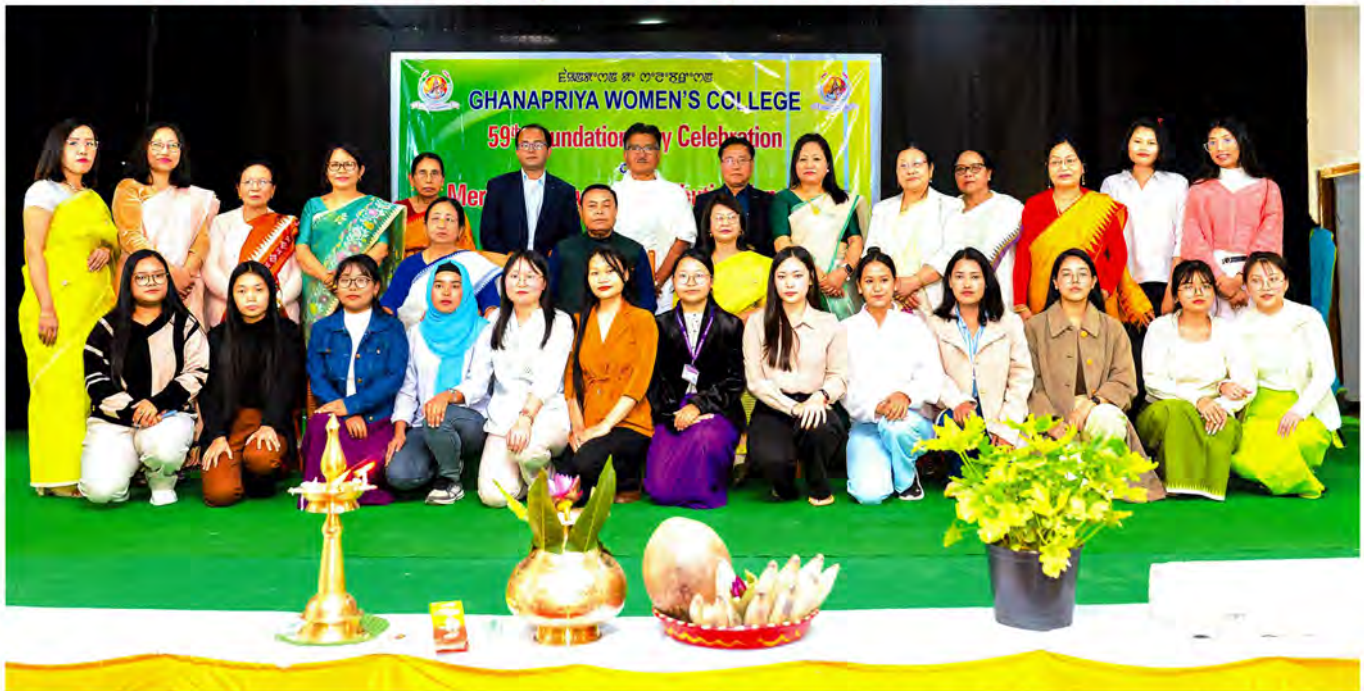
Ghanapriya Women's College Meritorious Award Donors and University/Colleges Subjects Toppers, 2023