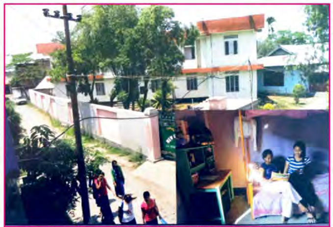
New Girls Hostel at G.P. Women's College campus