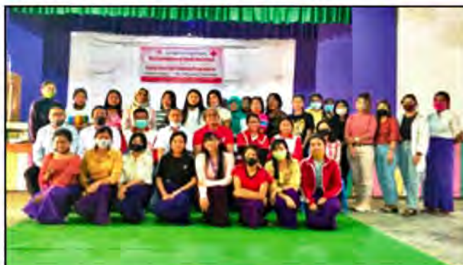
Dissemination of Youth Red Cross and Basic First Aid Training Programme