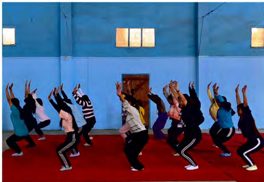
Activities of NSS Volunteers