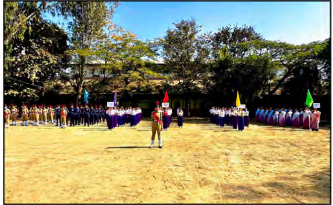
57th Annual InterHouse Sports Meet, 2022